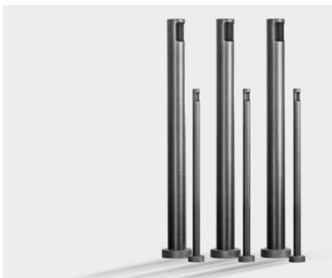
↑ SIGRABOND Chemical feed tubes